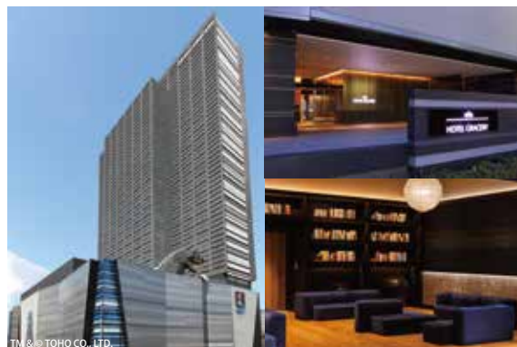
TM & © TOHO CO., LTD.

※The carrying contents are the one current as of March, 2026.